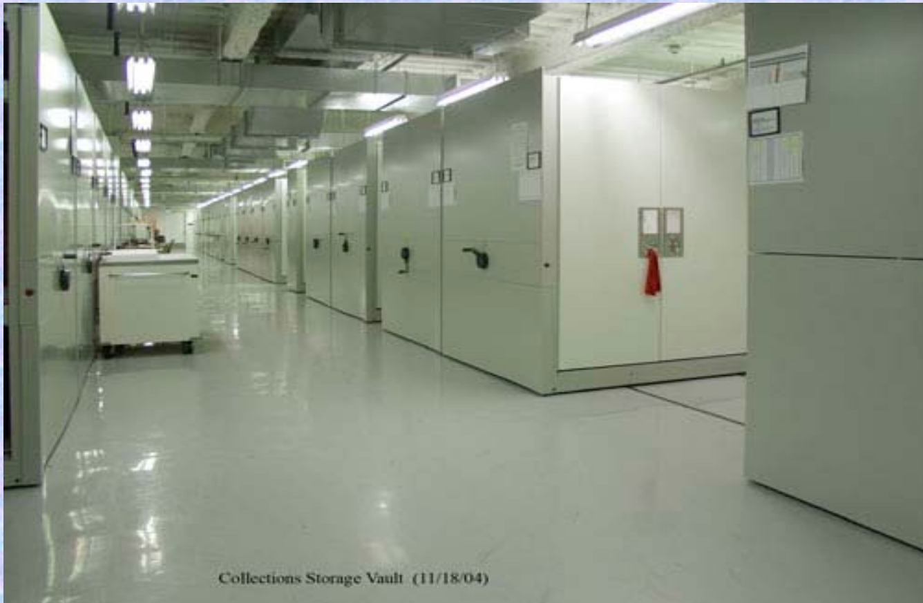
Collections Storage Vault (11/18/04)